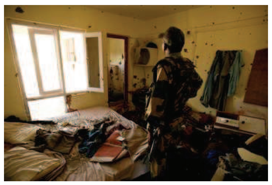
A day after an attack in the center of Srinagar's business district on July 29, 2005, Indian paramilitary soldiers inspect a room where a suspected Pakistani Islamist militant was killed.

He, along with several other Kashmiri rebel leaders, traveled to Pakistan several times to talk to Pakistani political leaders and meet with the militant groups based in Pakistan.<sup>523</sup> After one such meeting, however, Syed Salauddin of Hizb-ul-Mujahedin, who also leads the United Jihad Council, stated: "The need for an organized and massive armed struggle has increased today more than ever and the Kashmiri youth need to prepare themselves for fighting in maximum numbers"<sup>524</sup>