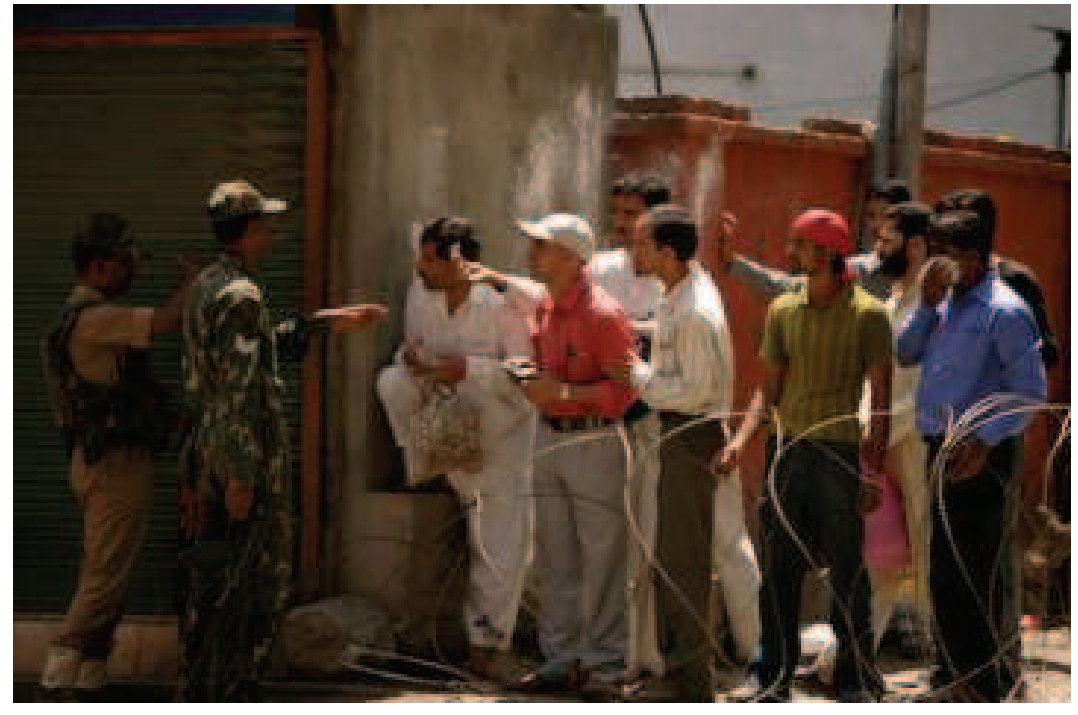
Indian paramilitary soldiers check the ID of local Kashmiri men trying to gain access to their offices the day after an attack by suspected Pakistani Islamist militants in the center of Srinagar's business district, July 30, 2005. Militants opened fire on nearby Indian security positions, stopping afternoon rush hour traffic and pinning down hundreds of soldiers and police. Five security men were killed and six other people were wounded, including local journalists caught in the crossfire. Two of the suspected militants were killed.

three, most of them civilians.<sup>484</sup> On May 22, 2006, two militants opened fire at a Congress party rally in Srinagar, killing six, including three civilians, and injuring thirty-five; the militants were also killed. Two militant groups, Lashkar-e-Toiba and Al Mansoorian, claimed responsibility.<sup>485</sup>