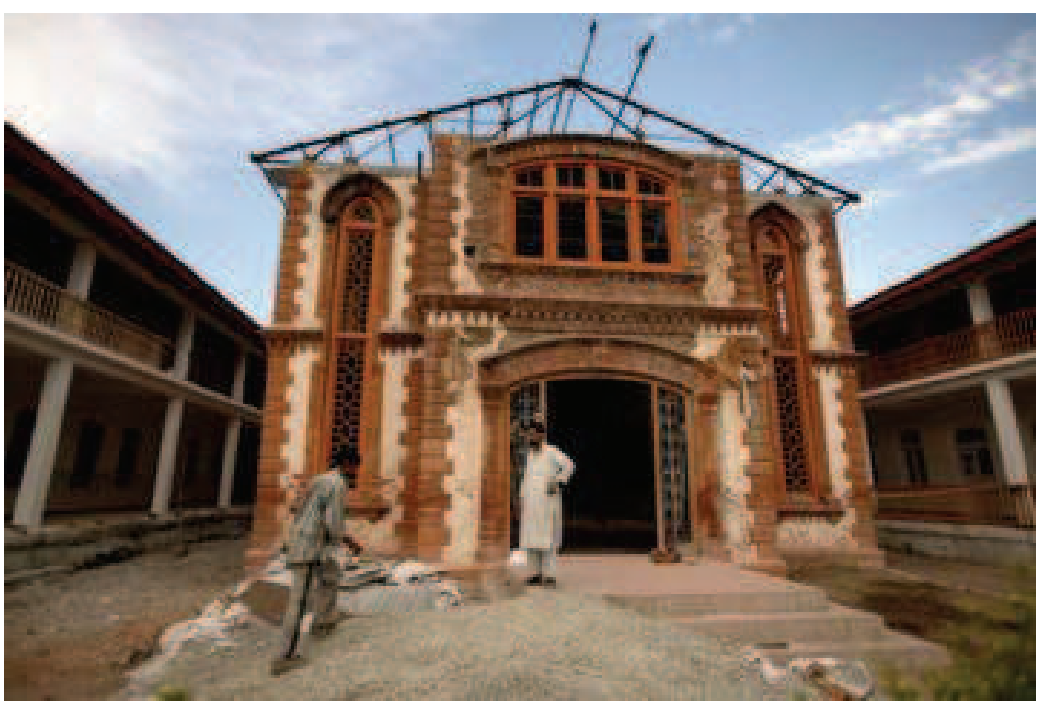
Laborers work on the reconstruction of the renowned Islamia High School in downtown Srinagar, August 2, 2005. The school suffered an arson attack in early 2005 by Pakistani-supported Islamist militants as a warning to the Kashmiri owner and religious leader of the school not to negotiate with the Indian Government over Kashmir's independence.

Militants in Kashmir have long been responsible for attacks on schools and for recruiting children into their forces. International humanitarian law prohibits attacks directed at civilians and civilian objects. Schools are protected as civilian objects, while teachers and students fall under the protection granted to civilians unless they are taking a direct part in hostilities. International law also prohibits the recruitment and use of children as soldiers and in other combat-related roles. The prohibition on the recruitment and use of children below the age of fifteen is now considered customary international law, and is binding on all parties to armed conflict. This standard is also reflected in the Convention on the Rights of the Child, which India ratified in December 1992. The Optional Protocol to the Convention on the Rights of the Child on the involvement of children in armed conflict, which India ratified in November 2005, prohibits state armed forces and rebel groups from recruiting or using in hostilities persons under the age of eighteen years. So