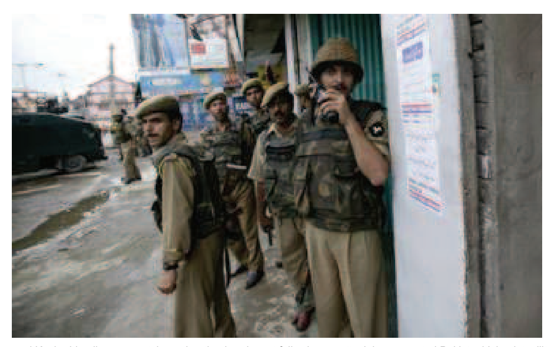
Indian and Kashmiri policemen watch as shooting breaks out following an attack by suspected Pakistani Islamist militants in the center of Srinagar's business district, July 29, 2005.

Although India has internal systems of inquiry and punishment, Human Rights Watch—despite several letters requesting the information from the Indian government—has received no details of any cases in which members of the Indian security forces have been prosecuted and convicted for serious human rights violations. In March 2006, Chief Minister Ghulam Nabi Azad said that 134 army personnel, seventy-nine members of the Border Security Force, and sixty policemen have been punished for committing human rights abuses since the insurgency first began. However, as no details of these incidents are available and the chief minister claimed at the same time that there were only 122 complaints of human rights violations since 2002, these figures cannot be taken at face value, and the commitment to transparently investigate, prosecute and punish individuals responsible for abuses remains in doubt. Instead, soldiers, paramilitaries, and police are routinely shielded by both their uniformed and civilian superiors in Jammu and Kashmir and New Delhi and by laws that make it extremely difficult to prosecute members of the armed forces in civilian courts.